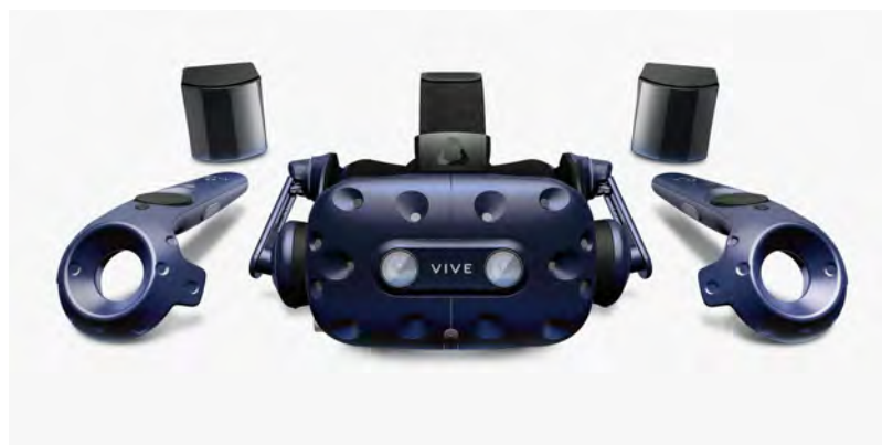
HTC VIVE VR Headset